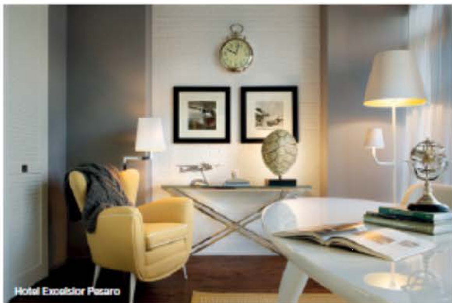
Hotel Excelsior Pesaro