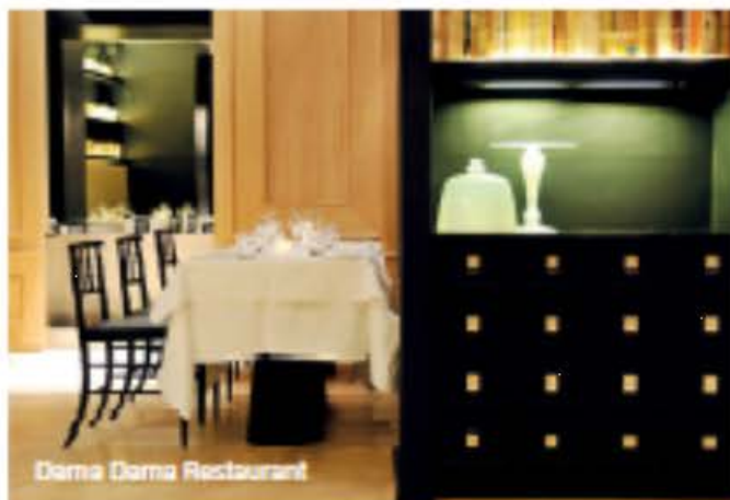
Dama Dama Restaurant