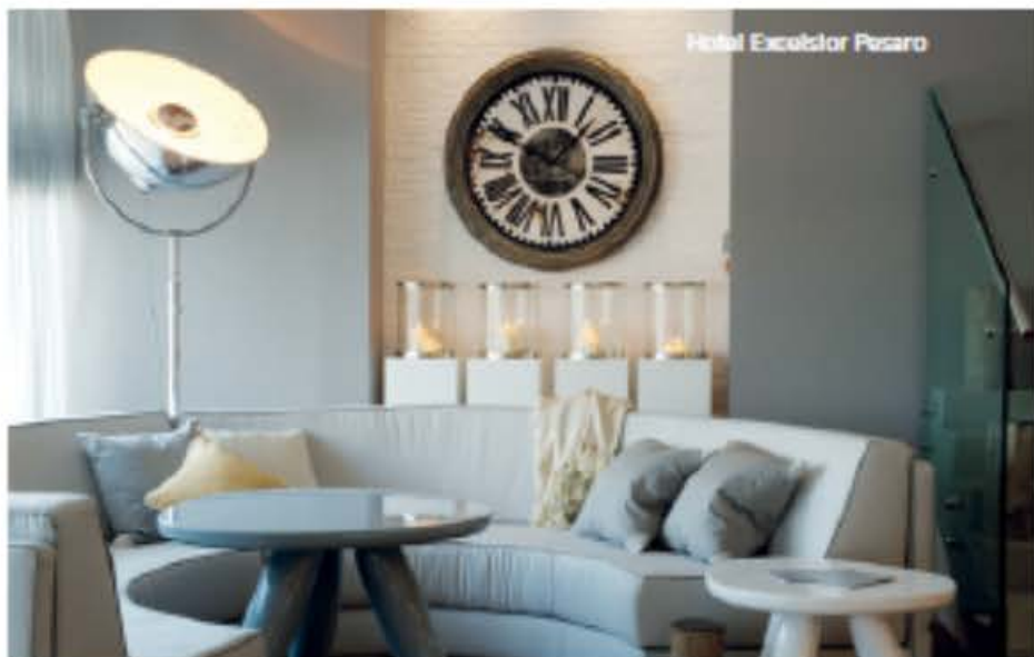
Hotel Excelsior Pesaro