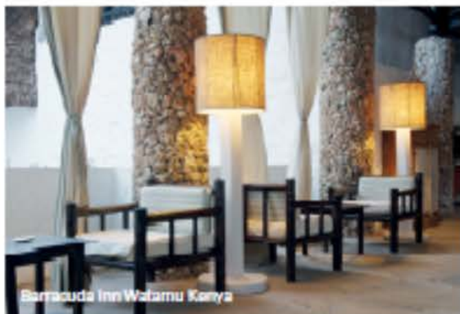
Barracuda Inn Watamu Kenya